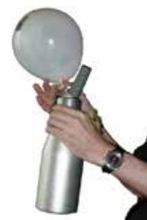
Image 3. Whipped cream dispenser